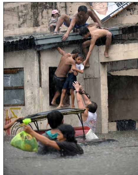
Helping hands raise a young boy to safety from the flooded street.

On September 26, 2009, Typhoon Ondoy (Ketsana) brought heavy rains to Metro Manila and nearby areas, causing severe flooding which resulted in the loss of over 250 lives and the displacement of hundreds of thou-