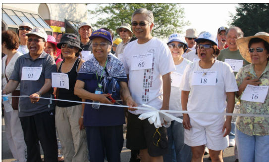
Everyone ready to start at the Walkathon (Aug. 15th)

the Ontario Trillium Foundation for funding the position of Coordinator who coordinates with the volunteers in the various activities of the organization. We just finished the first year of four within which we are to enjoy