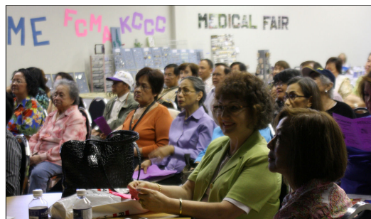
Listening attentively during lectures at the Medical Fair (Sep. 13th)