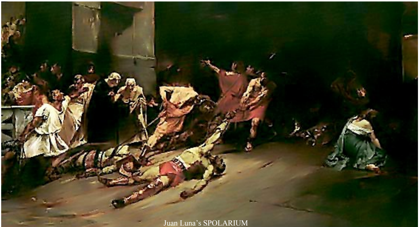
Juan Luna's SPOLARIUM